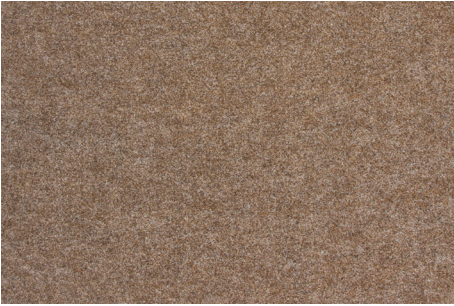
1081 Sepia 2 m - 4 m