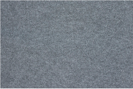
2071 Iron 2 m - 4 m