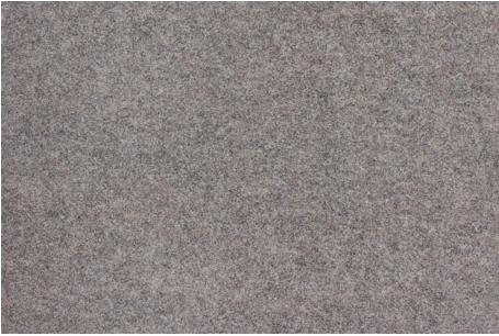
1046 Pebble 2 m - 4 m