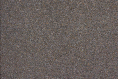
7021 Umber 2 m - 4 m