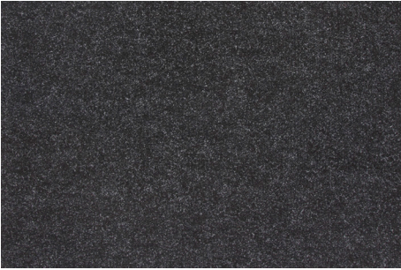
2122 Anthracite 2 m - 4 m