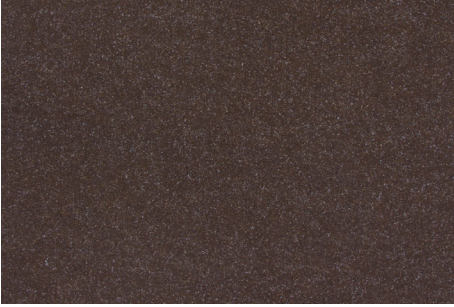
7075 Chocolate 2 m - 4 m