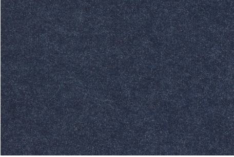
5101 Sapphire 2 m - 4 m