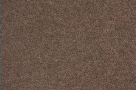
7745 Autumn 2 m - 4 m