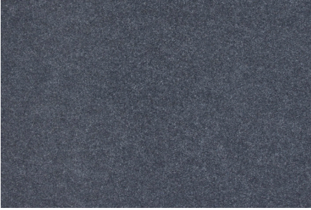
5088 Baltic Blue 2 m - 4 m