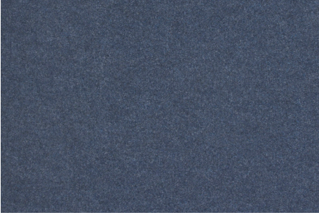
5059 Ultramarine 2 m - 4 m